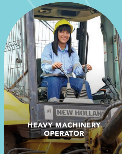
HEAVY MACHINERY OPERATOR