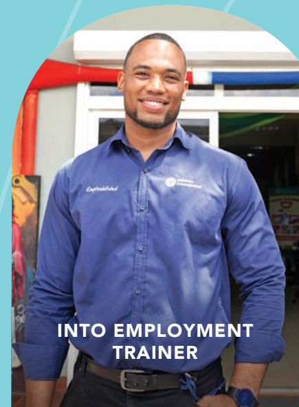
INTO EMPLOYMENT TRAINER