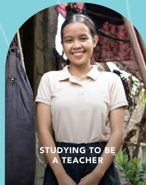
STUDYING TO BE A TEACHER