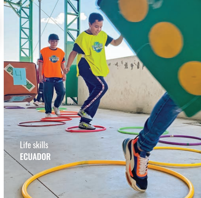
Life skills ECUADOR