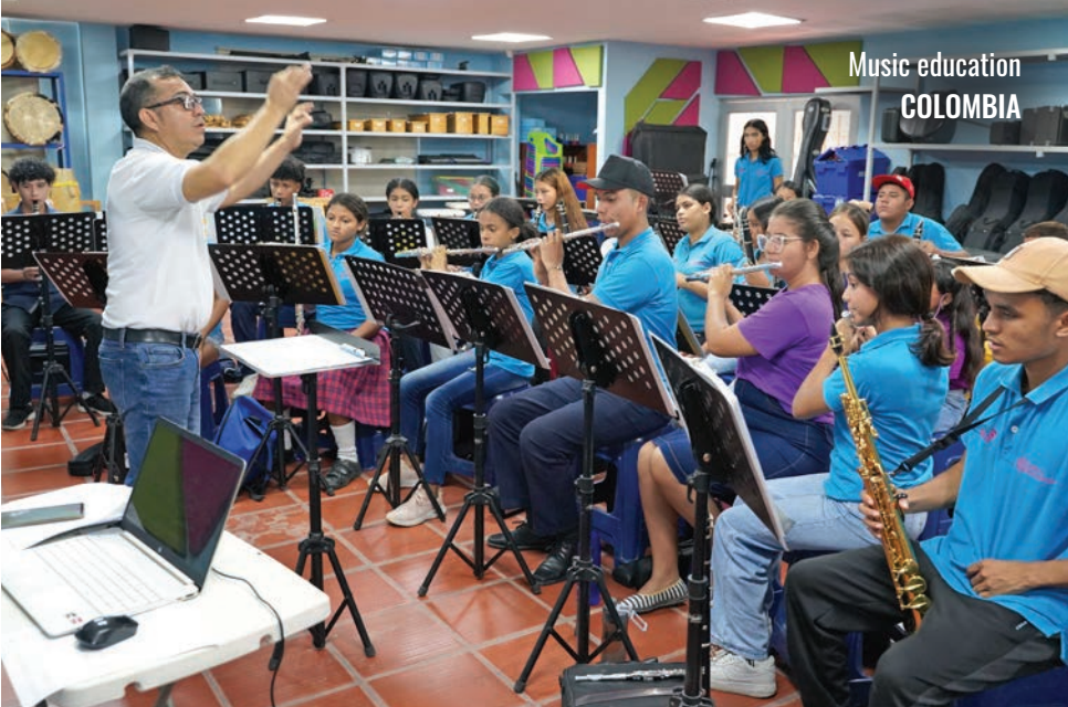
Music education COLOMBIA